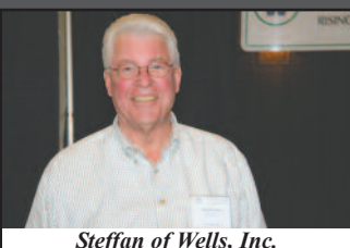
Steffan of Wells, Inc.