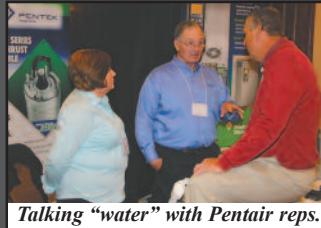
Talking "water" with Pentair reps.