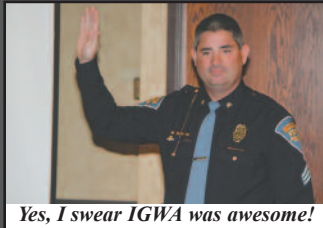
Yes, I swear IGWA was awesome!