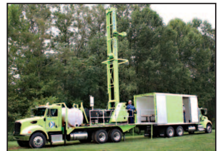
The TSi 150D shown here features an optional support vehicle.

One of the key features of the TSi 150 Series is the exclusive TSi 150 sonic oscillator which utilizes 150 horsepower to generate 50,000 pounds of oscillating force providing the ability to drill to a rated depth of 700 feet* with 6-inch* casing. The TSi 150 Series of sonic rigs is large with robust structures and simplified hydraulics for reliability and low maintenance. They are available skid mounted, in crawler configurations, and mounted on a variety of truck carriers. These rigs offer a full rotational drilling capability and are available with numerous options including short and long masts, custom support vehicles, and complete TSi heavy-duty sonic drill tooling packages to suit a variety of drilling applications.