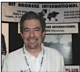
Bit Brokers International is sure to have their latest products on display in San Antonio.

Considered the Super Bowl of the deep foundation industry, more than 2000 industry leaders from more than 40 countries are expected.